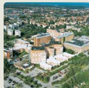
Kalmar County Hospital