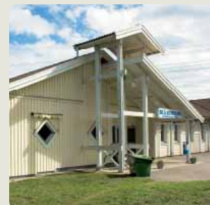
Blå Kusten – one of the county's 27 health centres